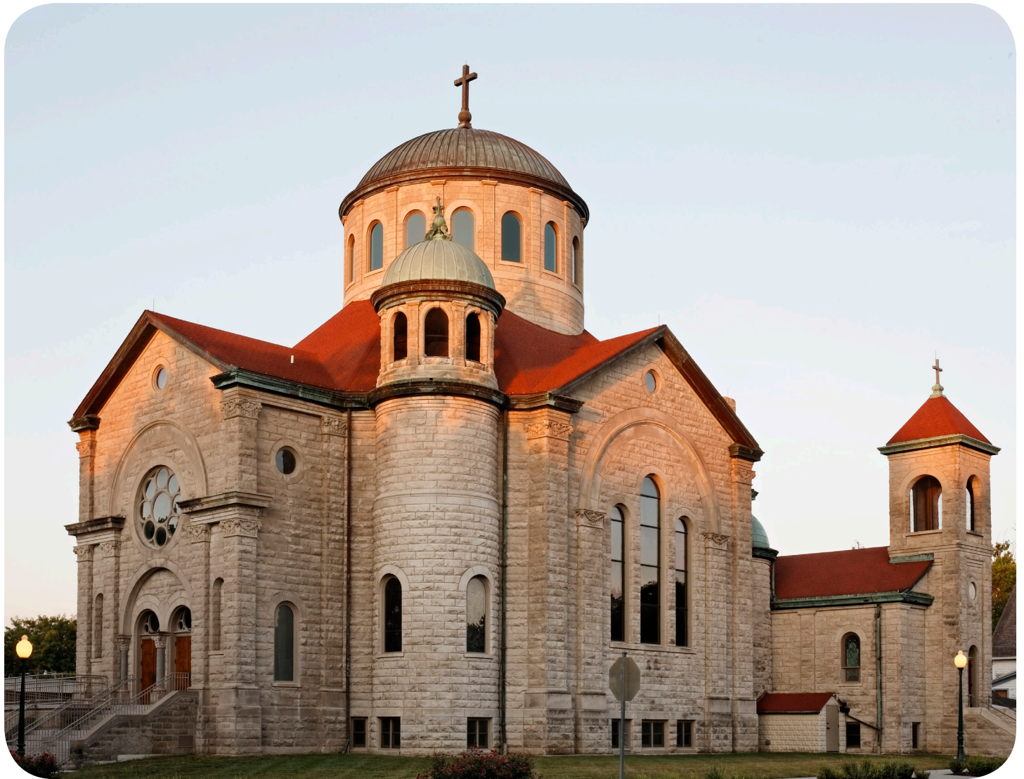
Saints Center for Culture and the Arts

Dallas, Adair and Guthrie Counties in Southwest Iowa